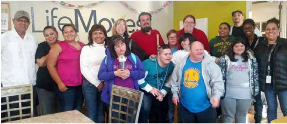
CAA student council donated toiletries and socks to LifeMoves, an organization that helps give hope to homeless people