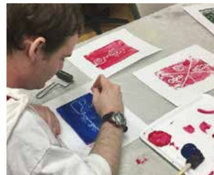
Creating a masterpiece in art class

We sometimes charge a little money to have social gatherings at the end of some months where we just hang out. Please look us up if you know someone who would like CAA. We have scholarships and we'd love to have you!