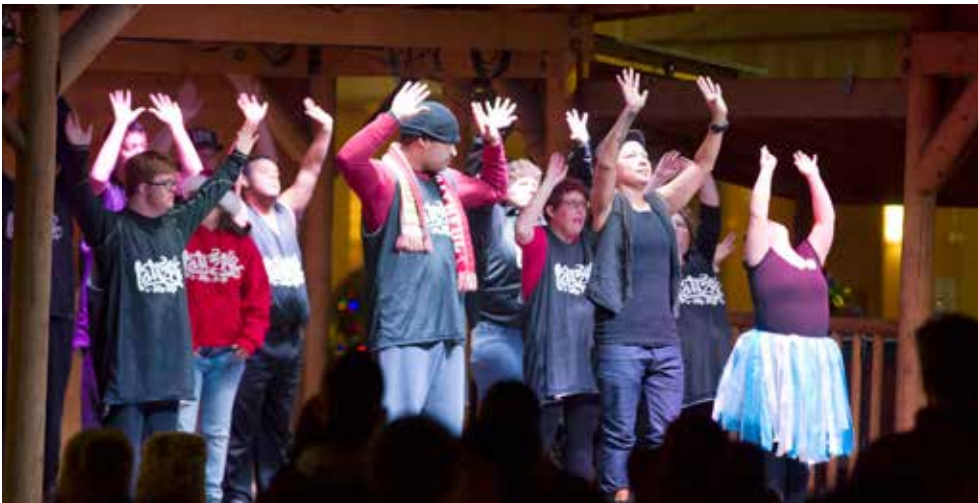
CAA dance students in one of several performances at San Jose's 2016 Christmas in the Park